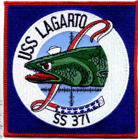
USS Lagarto SS-371