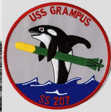
USS Grampus SS-207