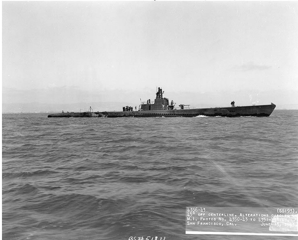
Photo # 19-N-51811 USS Swordfish underway off San Francisco, California, 13 June 1943