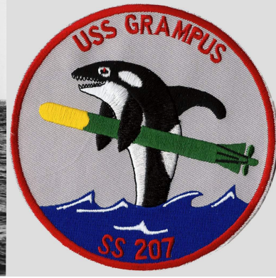
USS Grampus SS-207