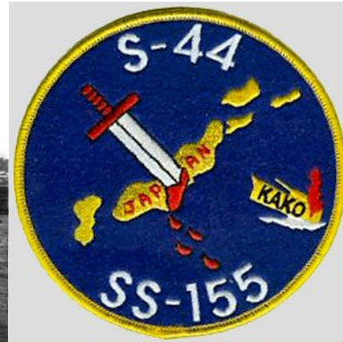
USS S-44 (SS 155)