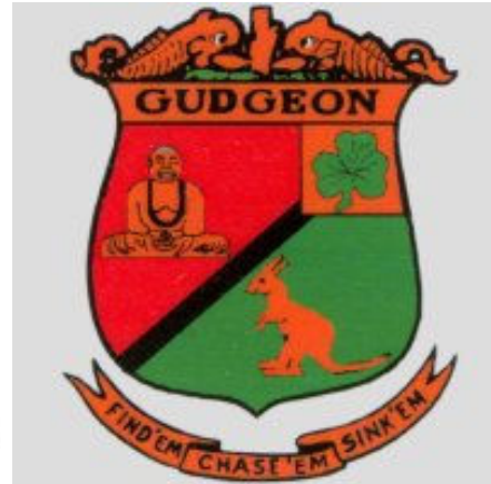
USS Gudgeon SS-211