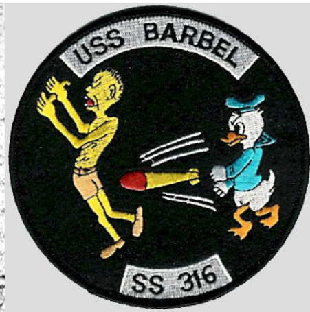
USS Barbel SS-316